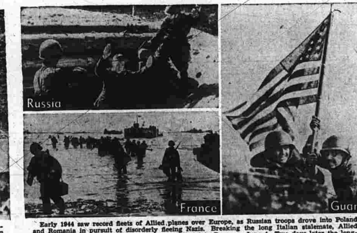
Early 1944 war record fleets of Allied planes over Europe, as Russian troops drove into Poland and Romania in pursuit of disorderly fleeing Nazis. Breaking the long Italian stalemate, Allied troops took bitterly defended Cassino and rolled into Rome on June 4. Two days later the long-awaited invasion came, as Allied troops landed in Normandy, consolidated beachheads, and took Cherbourg. Desperately the Nazis hurled robot plane bombs against England, to be met with the combined British and U. S. armies started the muddy, bloody march up the peninsula, as new offensives began to shape in the Pacific with Allied landings on the Treasury Islands, Chosenia, and Bougainville. The Blue, stubborn Chinese fighters, re-fortified by Allied training and supplies, wheeled and slowly began to regain the vast Jap-conquered territories in China and Burma. German defenses in southern Russia collapsed, as Soviet troops broke into the Crimea and began chasing the Nazi invaders back across the frozen Ukraine. Allied pace in the South Pacific quickened as Yanks and Aussies landed on the Gilberts and New Britain.