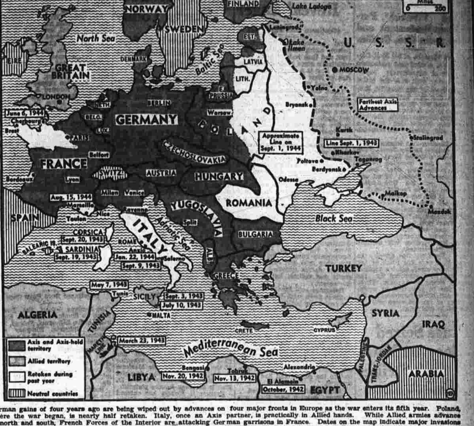
German gains of four years ago are being wiped out by advances on four major fronts in Europe as the war enters its fifth year. Poland, where the war began, is nearly half retaken. Italy, once an Axis partner, is practically in Allied hands. While Allied armies advance in north and south, French Forces of the Interior are attacking German garrisons in France. Dates on the map indicate major invasions and conquests of Allied forces since El Alamein in 1942.