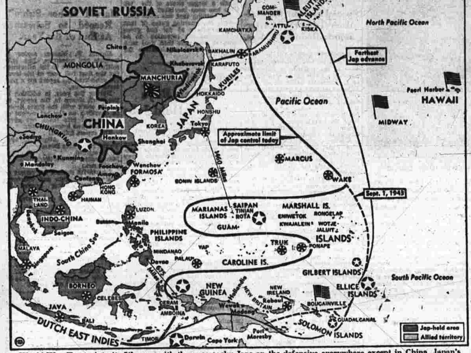
World War II goes into its 5th year with the once costly Japs on the defensive everywhere except in China. Japan's advances in the Pacific, beginning with the Philippines after the Pearl Harbor attack, were rapid. The return, slow at first, began gathering speed with the landings in the Gilbert, Marshalls and Marianas within recent months. New Guinea has been retaken, so have the Solomons with the exception of enemy forces isolated at Bougainville, Raboul and New Ireland, by-passed in the rapid advance, are virtually useless as bases to the enemy and Jap troops there, are doomed. Allied Pacific forces are now within striking distance of the homeland of Japan and the Philippines, while B-29 Super-Fortresses, from China bases, blast Japan itself with increasing frequency.