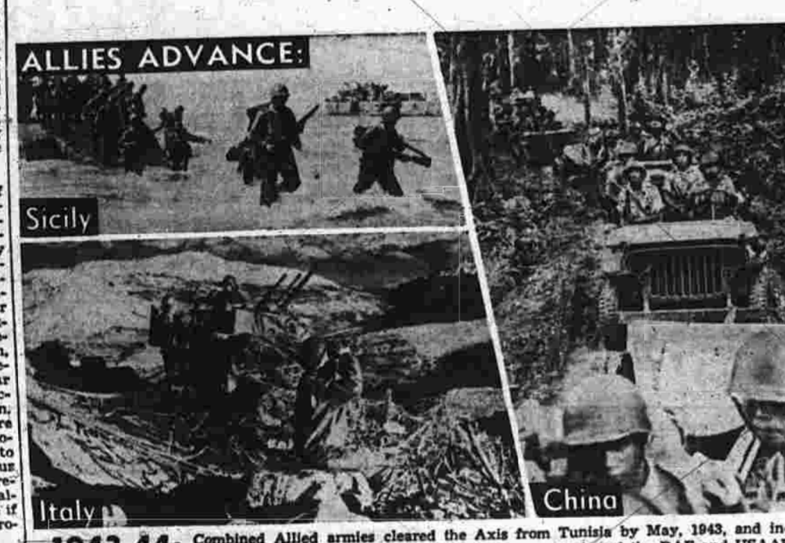
1943-44: Combined Allied armies cleared the Axis from Tunisia by May, 1943, and invaded Sicily two months later. Mussolini was ousted, and the RAF and USAAF offensives began to shape in the Pacific with Allied landings on the Treasury Islands, Chosenia, and Bougainville. The Blue, stubborn Chinese fighters, re-fortified by Allied training and supplies, wheeled and slowly began to regain the vast Jap-conquered territories in China and Burma. German defenses in southern Russia collapsed, as Soviet troops broke into the Crimea and began chasing the Nazi invaders back across the frozen Ukraine. Allied pace in the South Pacific quickened as Yanks and Aussies landed on the Gilberts and New Britain.