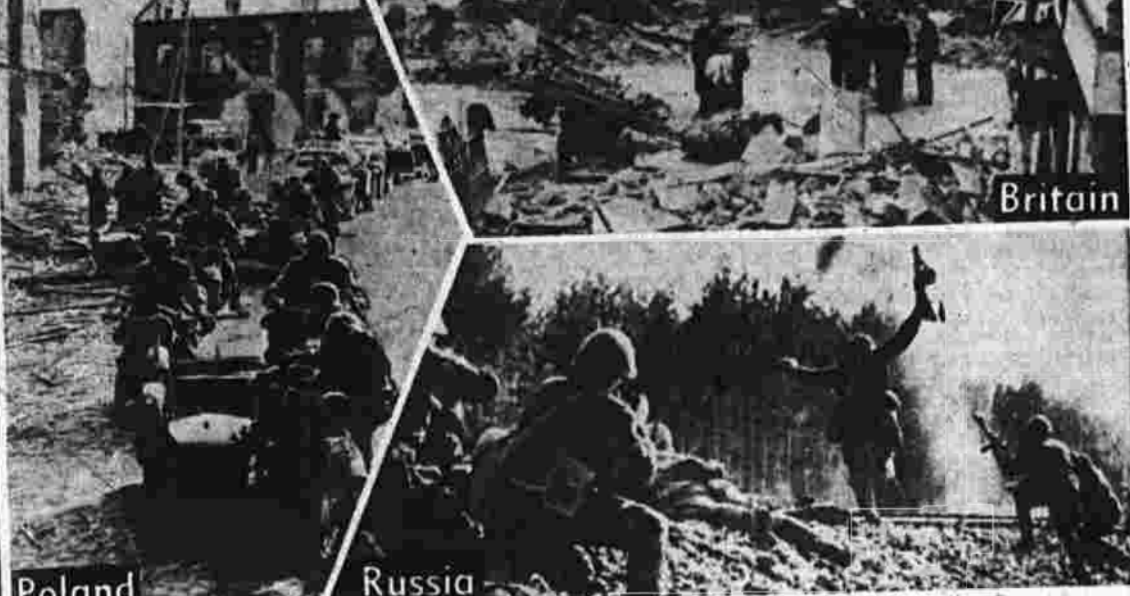
1939-41: Adolf Hitler touched off history's greatest war with his invasion of Poland on Sept. 1, 1939. After a winter lull in the west, while Russia fought Finland, the Nazis attacked Denmark, Norway, the Low Countries and France, and swiftly conquered all of them. Italy jumped in on an Italian front and began attacking the British in Africa. The battle of Britain began in late 1940, and promptly RAF beat off the Luftwaffe. Prominent Mussolini invaded Greece in October, 1940, and promptly got pushed back on his heels by the "army in skirts." The Balkans jumped on the Axis bandwagon, Germany invaded Yugoslavia and Greece in April of 1941, and began pushing the British wagon, Germany invaded Yugoslavia and Greece in April of 1941, and began pushing the British wagon, Germany invaded Yugoslavia and Greece in April of 1941, and began pushing the British wagon.