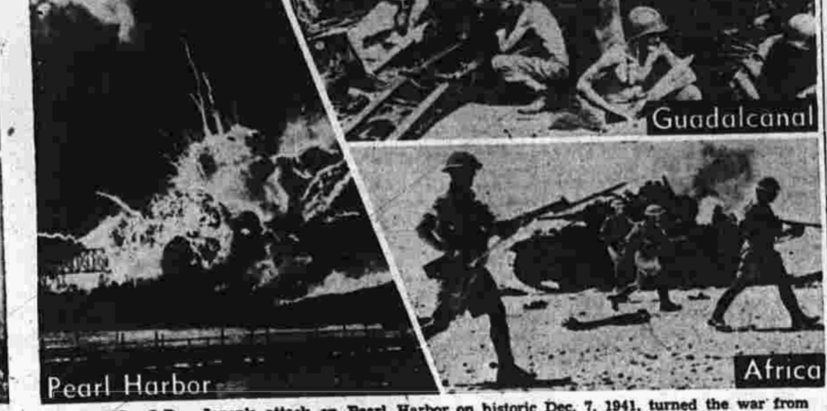
1941-43: Japan's attack on Pearl Harbor on Dec. 7, 1941, turned the war from a European struggle to a global conflict, as the U. S. went to war against Japan, Germany and Italy. Guam, Wake, Hong Kong, Singapore and the Philippines fell to the Japs, who invaded Borneo, Celebes, New Britain, the Solomon, Bali, Rangoon and Java. General MacArthur took command of U. S. forces in the South Pacific and General Eisenhower headed the U. S. European Theater of Operations, as American fighting men were sent to all parts of the world—to Australia and New Guinea, to the Jap-invaded Aleutians, and England. By the summer of 1942, the U. S. was winning battles like the naval-air clashes in the Coral Sea and at Midway, and in August, Yank and Australian troops landed in the Solomons and began pushing the Japs back. The war spotlight swung back to Europe with the invasion of North Africa in the Japs back. The war spotlight swung back to Europe with the invasion of North Africa in the Japs back. The war spotlight swung back to Europe with the invasion of North Africa in the Japs back.